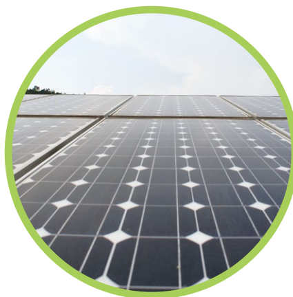
Photovoltaic Panel 太陽能光伏板