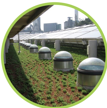
Green Roof and Sunpipes 綠色天台及陽光導管

信佳集團管理有限公司是世界頂尖的服務公司，員工超過 46,000 人，業務涵蓋 30 多個國家；而佳定物業管理有限公司是香港其中一間最大的物業管理服務公司。