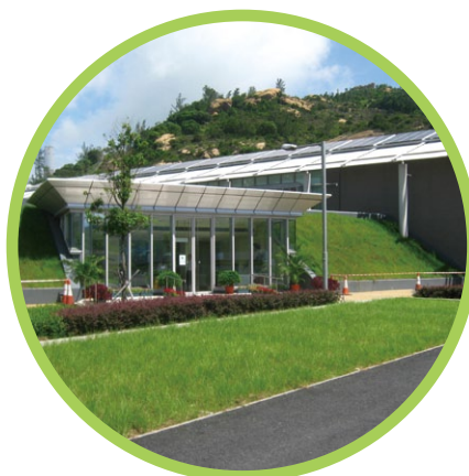
Green Environment 綠化環境