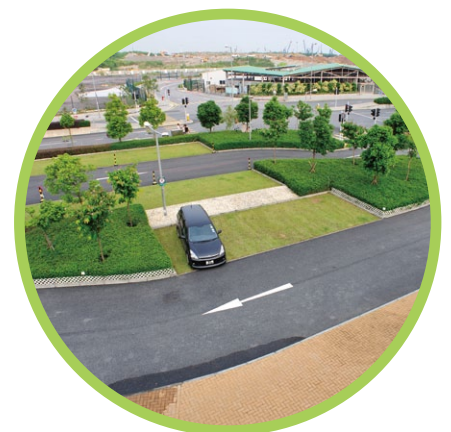
Green Carpark 草地車位