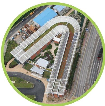
Administration Building 行政大樓

Serco Group is one of the world's leading service companies, employing over 46,000 people in more than 30 countries, and Guardian is one of the largest property management service providers in Hong Kong.