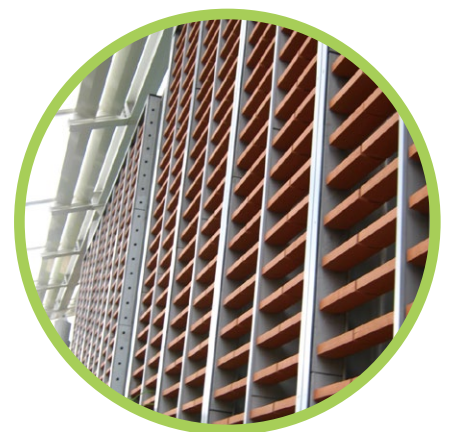
Terracotta Louvres 防陽光百葉牆